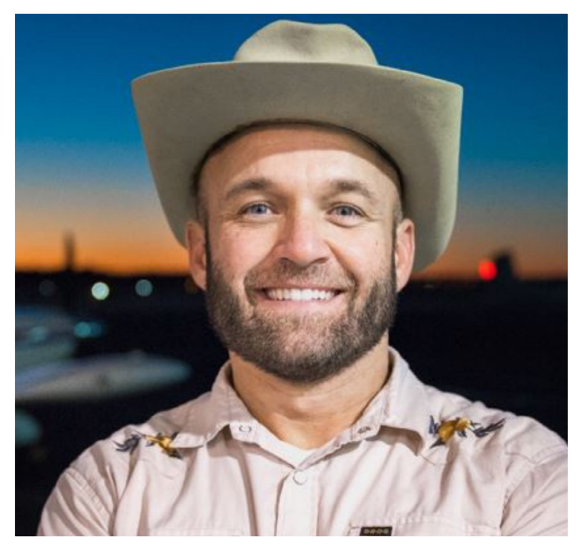
Author of the bestselling book "The Type A Trap: Five Mindset Shifts to Beat Burnout and Transform Your Life"